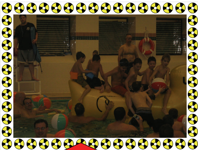
A picture from last year on the now retired "yellow Submarine"

It all starts at about 6:00 with boat judging with the races to start about 7:00. Pizza and Drinks are FREE! New Member Plaques will be presented!