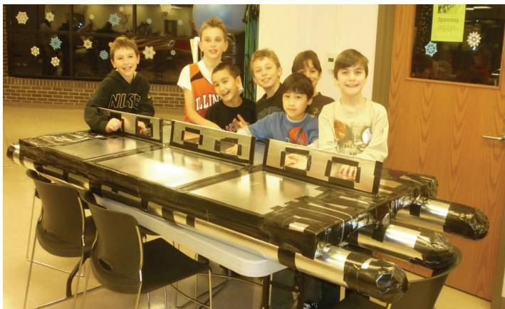
"The D-Back Destroyer"