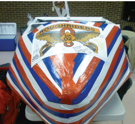
Government approved, Sea ready, Roughrider "Vessel of Victory"

All the boats were the best we have seen in years! Creative designs, colorful, and they all lasted through all the races. The roughriders came away with the best overall design and the D-Backs won Most Creative