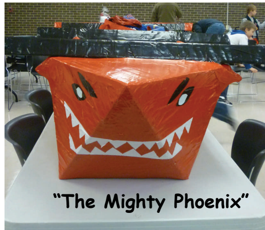
"The Mighty Phoenix"