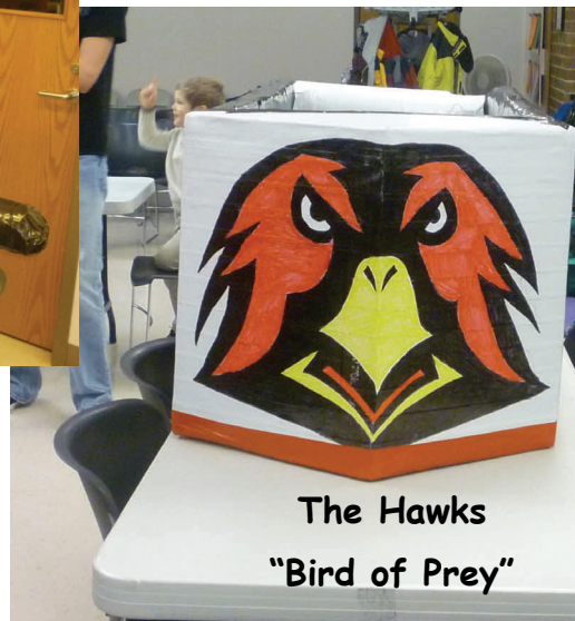
The Hawks "Bird of Prey"